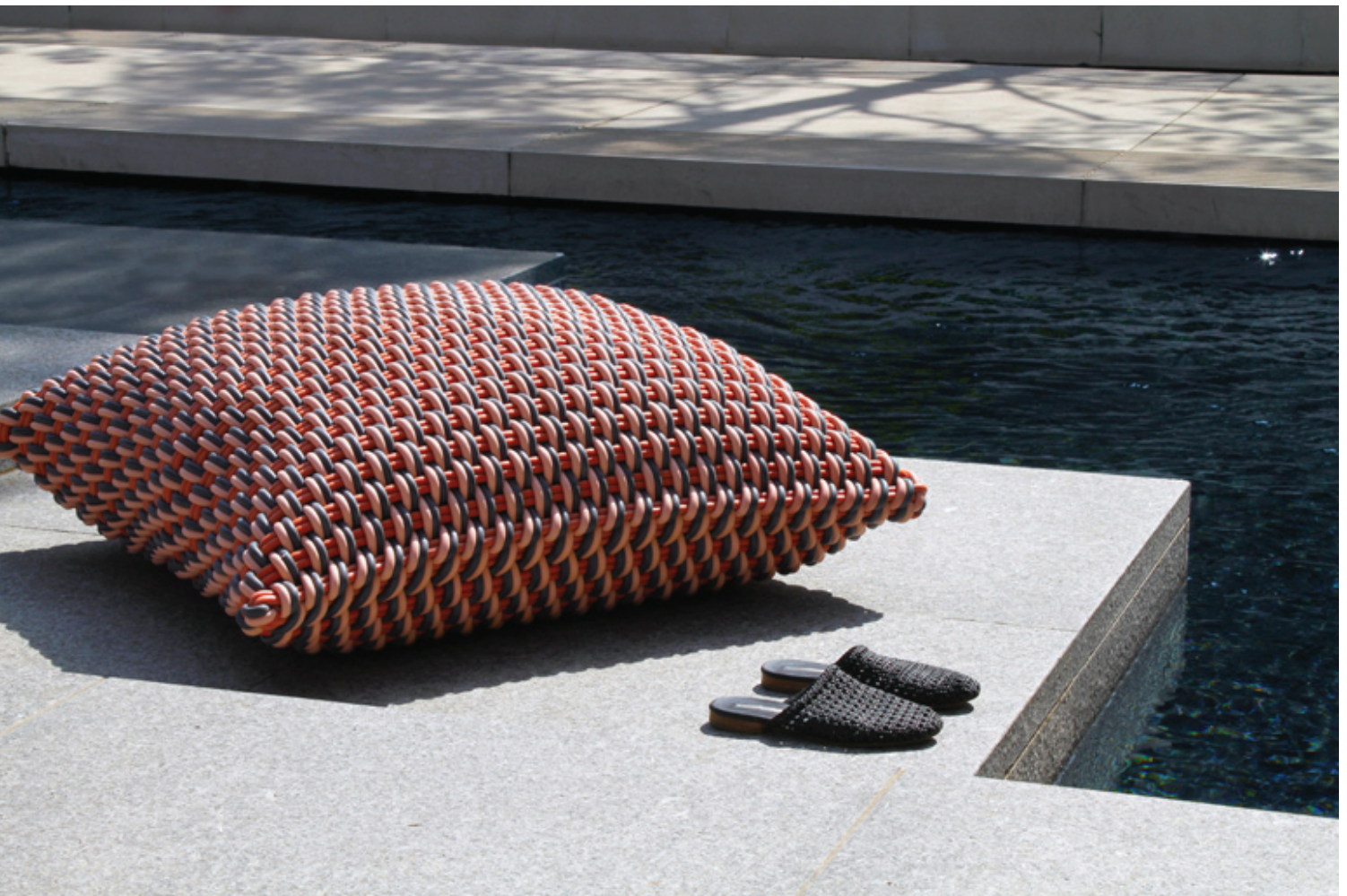
Jupiter Sky Pouf, 3' x 3' x 1'