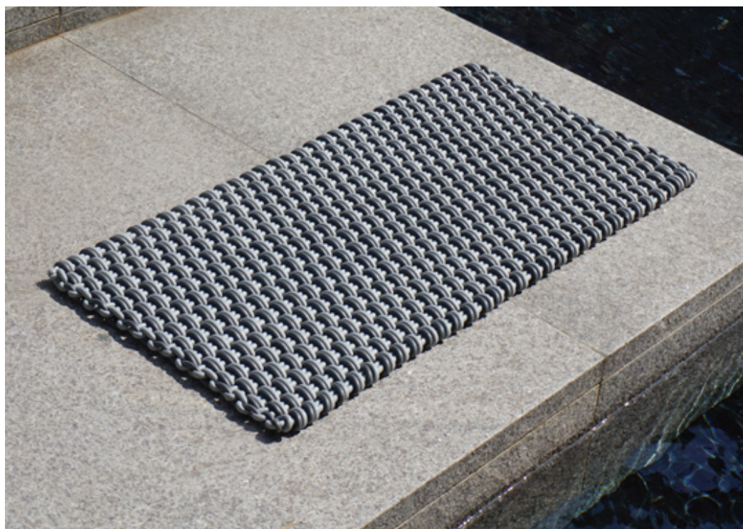
Meteorite Mat, 2' x 4'