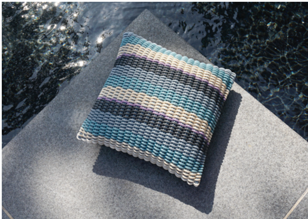
Twilight Sea Pillow, 16" x 16"