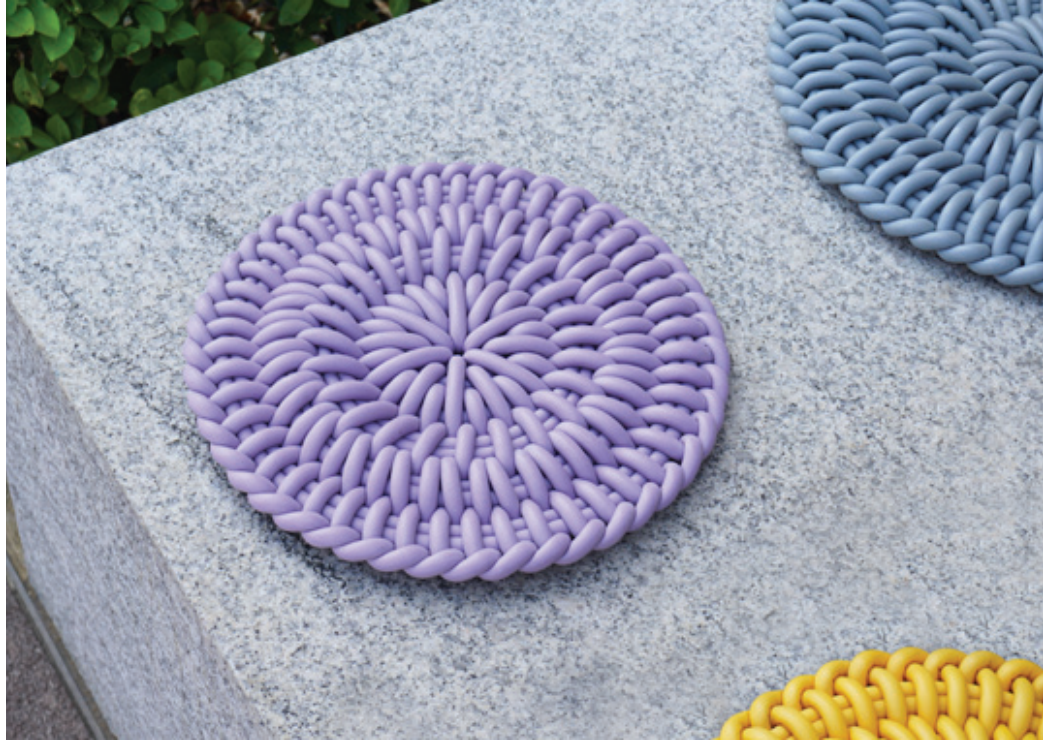
Lavender Seat Cushion, 12"